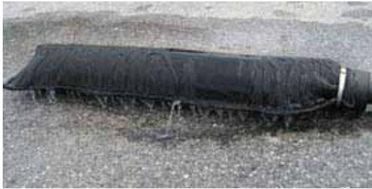
EVAC Filtration System filtering water.