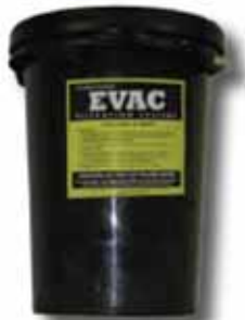
UN certified liquid-tight container.

*Always check with Local, State, and Federal Regulations prior to disposal.