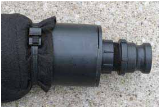
Two-inch Camlock quick connect fitting.